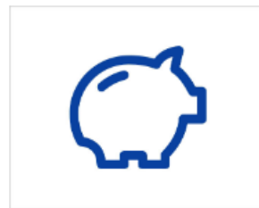
10¢/gallon* everyday savings for members